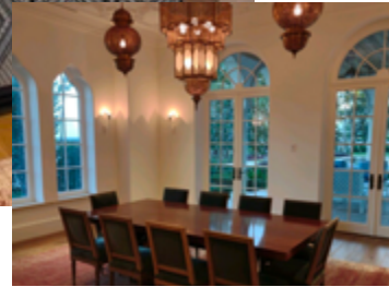
Table 26 Restaurant