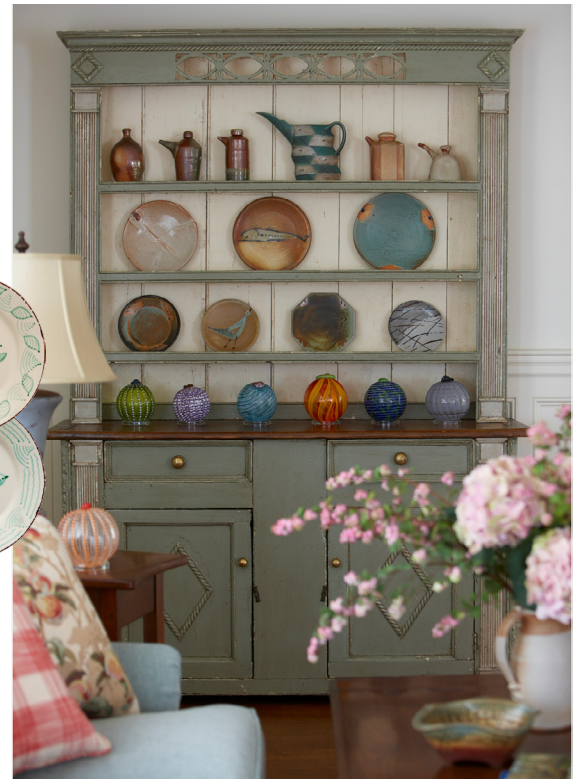
Designed by GW Interiors