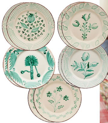
Casa nuno green available at chairish.com

Reminiscent of the classic blue and white azulejos, these ornate green and white ceramics are drawing collectors for their size and designs.