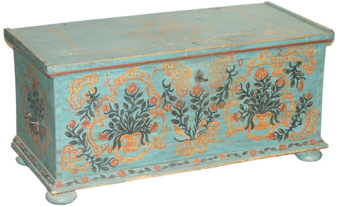
1802 antique original paint european blanket chest available at 1stdibs.com

With a definite uptick in traditional furniture over the past year, ornate chests from every era are highly sought after on online vintage marketplaces like Chairish and 1stdibs—the more ornamentation the better.