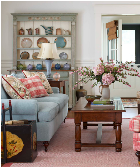
Designed by GW Interiors

Instead of Mid Century Modern , try 70s Revival . We're trading in the streamlined designs of Mid Mod for the rich fabrics and geometric shapes of the 70s.