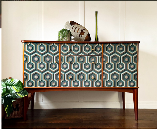
Walnut & rosewood tv stand available at vinterior.co

Here are just a few of the trends we see phasing out for bold new ideas this season.