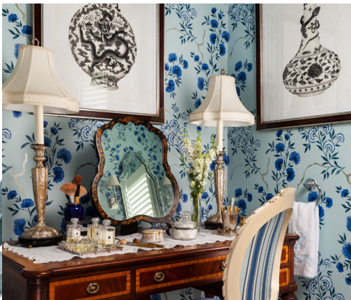
Designed by GW Interiors