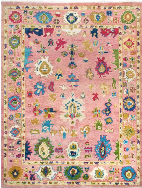
1960s vintage turkish area rug available at chairish.com

Unlike the rich reds and jewel tones that come to mind, large Turkish rugs with soft or unusual coloring are today's top sellers.