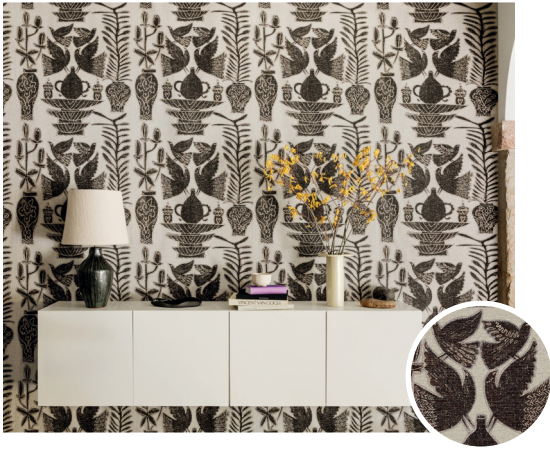
Lins brodés paros available at elitis.fr