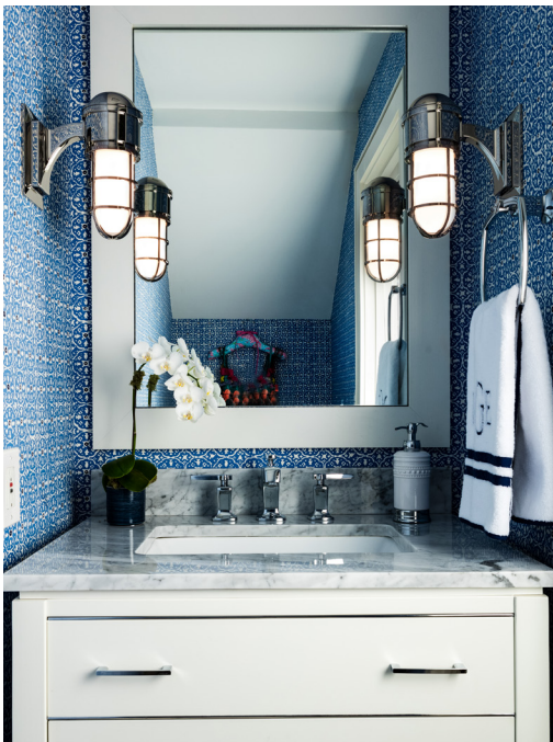
Designed by GW Interiors

This bold choice of wallpaper is best used to elevate smaller spaces, giving it a look of "cozy elegance" that is dominating the design world.