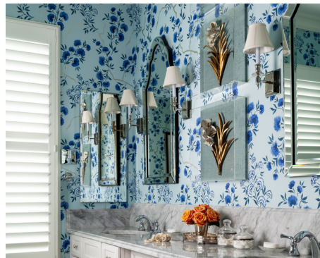
Designed by GW Interiors

Instead of Traditional Wall Art , try Ornate Wallpaper . Forgo an eclectic art display for a Maximalist-inspired print that doubles as an accent wall.